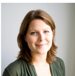
Eva Primavesi Public Relations

I am happy to assist you! For further inquiries please contact me: